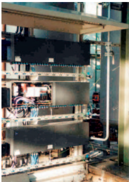
Figure 4: Field stations installed outdoors

The Wacker production plant was officially put into service on 26 November 2001 after a project handling time of two years. The experience gained from this project has been incorporated in other projects, and three further installations have now been equipped with R. STAHL Remote I/O. Over 80 I.S. 1 field stations of a wide variety of designs operate reliably at WACKER in its Nünchritz plant and make their contribution to success of this project.