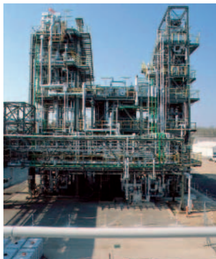
Figure 1: The Alkoxy plant at WACKER Chemie in Nünchritz, Germany

50 kilometres to the north of Dresden in Germany lies the municipality of Nünchritz. It has been a chemical site for over a century. In 1998, the Munich WACKER Group took over the production complex there manufacturing silicones and their intermediate products, chlorosilanes, silicates and pyrogenic silicic acids (Figure 1). The plant now employs a workforce of around 870.