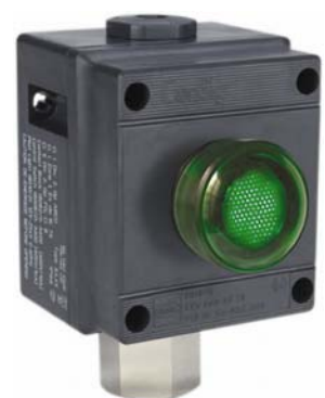
8040/114-PLG0 Green Pilot Light 3/4"