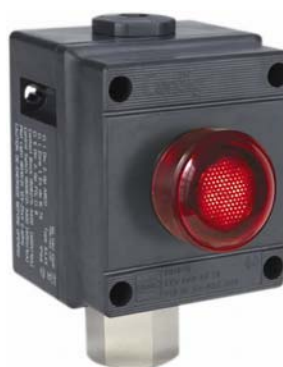
8040/114-PLR0 Red Pilot Light 3/4"