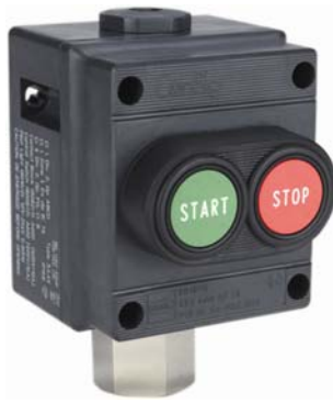
8040/114-U2312 Compact Start/Stop 3/4"