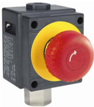
8040/114-Y150 Compact Mushroom Head 3/4"

The Following Consig 8040 Control Stations are now in stock: