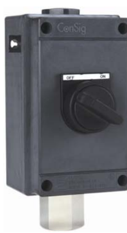
8040/124-N021 2 Position Selector Switch Off-On 3/4"