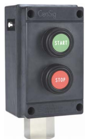
8040/224-U011-U012 Standard Start/Stop 3/4"