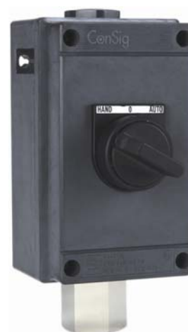
8040/124-N273 3 Position Selector Switch Hand-Off-Auto 3/4"